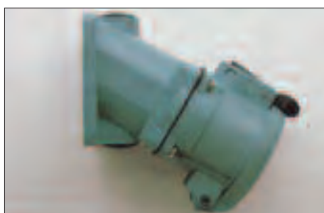
1A. Wall mounting socket