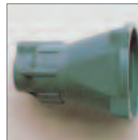
B. Cable gland