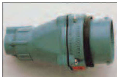
2B. Mobile plug