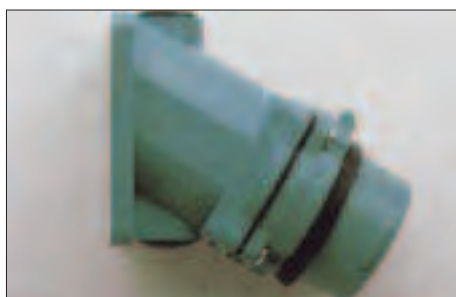
2A. Wall mounting appliance inlet