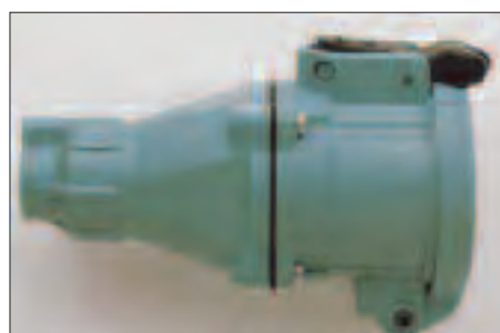
1B. Cable coupler