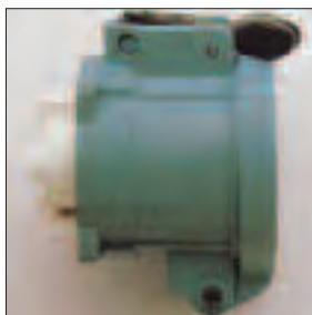
1. Panel mounting socket