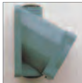
A. Wall box