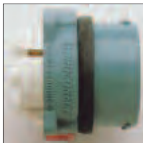
2. Appliance inlet