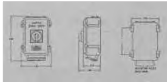
M10 Mounting bolts