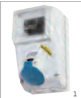
1. Socket with earth leakage or fuses in window compartment.

Please let us attend to your special requirements.