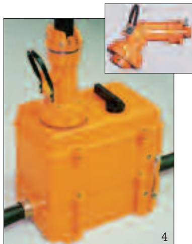
4. Harbour crane and ship to shore plugs and sockets 250A switched, fused and interlocked, to be installed in niches below quay.