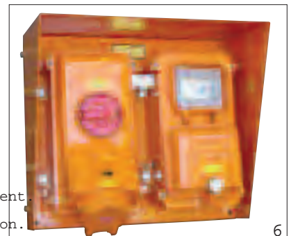
6. Canopy plug and socket combination.