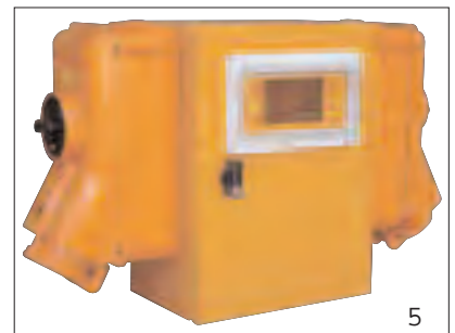
5. Special plug and socket arrangement.