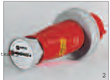
2. Electronic earth leakage test plug. Stock number see page 19.