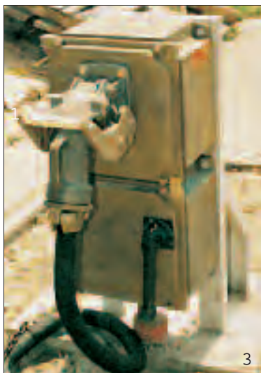
3. Harbour crane and ship to shore plugs and sockets 320/400 A.