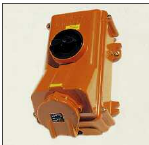
DIMENSIONS: IN mm