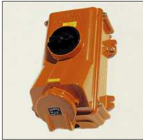
DIMENSIONS: IN mm