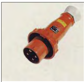
DIMENSIONS: IN mm