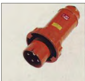
DIMENSIONS: IN mm