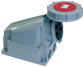
Wall Socket Includes "Pilot Contact"