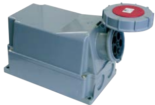
Wall Socket Includes "Pilot Contact"